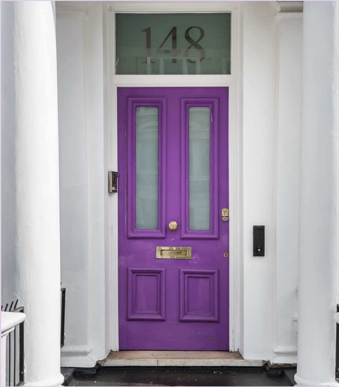
HOLLAND ROAD, LONDON W14